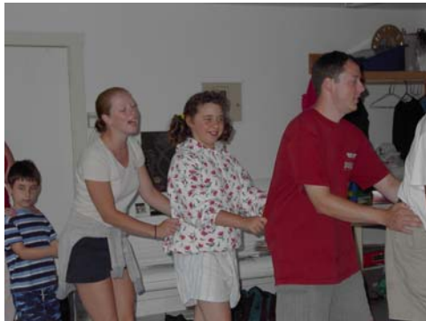
Summer Fun FAN Club Participants